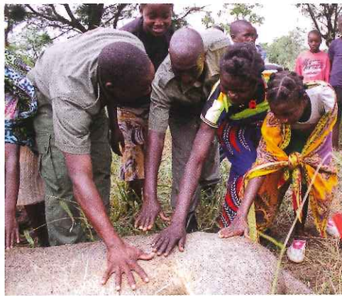
Figure 3 | Biological education in Gorongosa National Park. Members of the Nhamatanda Environmental Club meet a lion that was immobilized as part of the Gorongosa Lion Project's conservation programme.