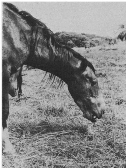
Fig. 4. Range horse breaking a ripe fruit of Crescentia alata between its incisors (19).

The postulated constriction of the range of C. alata after the extinction of the Pleistocene horse may affect other animals in the habitat. For example, nectarivorous bats would be affected by a reduction in jicaro density. The flowers of C. alata are nocturnal, abundant, and heavily visited by four species of nectarivorous bats in Guanacaste deciduous forests (24), and are the only common nectar source available to bats in the park forests during several months of the rainy season. The decline of the jicaro