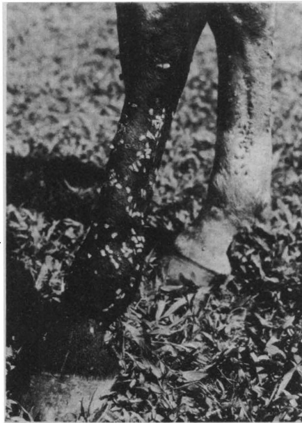
Fig. 5 (left). Spines, 7 to 11 centimeters long, on the underside of the petiole of the leaf of sapling Acrocomia vinifera (19). Fig. 6 (right). Desmodium (Leguminosae) beggar's-ticks stuck to the forelegs of a free-ranging horse on the edge of the Costa Rican rain forest (38).