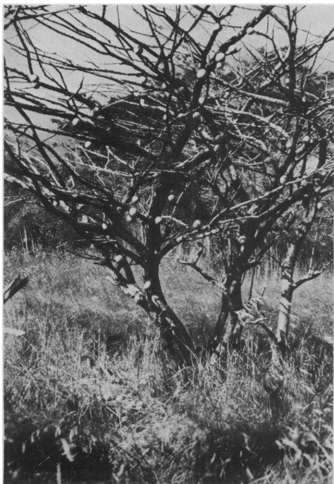
Fig. 3. Adult Crescentia alata with full-sized immature fruit during the dry season. Naturally fallen ripening fruits are visible on the ground to the left of the tree (19).

When range horses are free to forage below the trees, they quickly consume the crop of jicaro fruits. The hard fruits are broken between the incisors (Fig. 4), an act that requires a pressure of about 200 kilograms (22). The gooey pulp is scooped out with the tongue and incisors and swallowed with little chewing. For more than ten consecutive days, three captive and well-fed range horses ate the fruit pulp of 10 to 15 fruits in each of two meals a day, one in the morning and one in the evening (22). A herd of 17 range horses broke and consumed 666 jicaro fruits in one 24-hour period (22). The percentage of seeds that survive passage