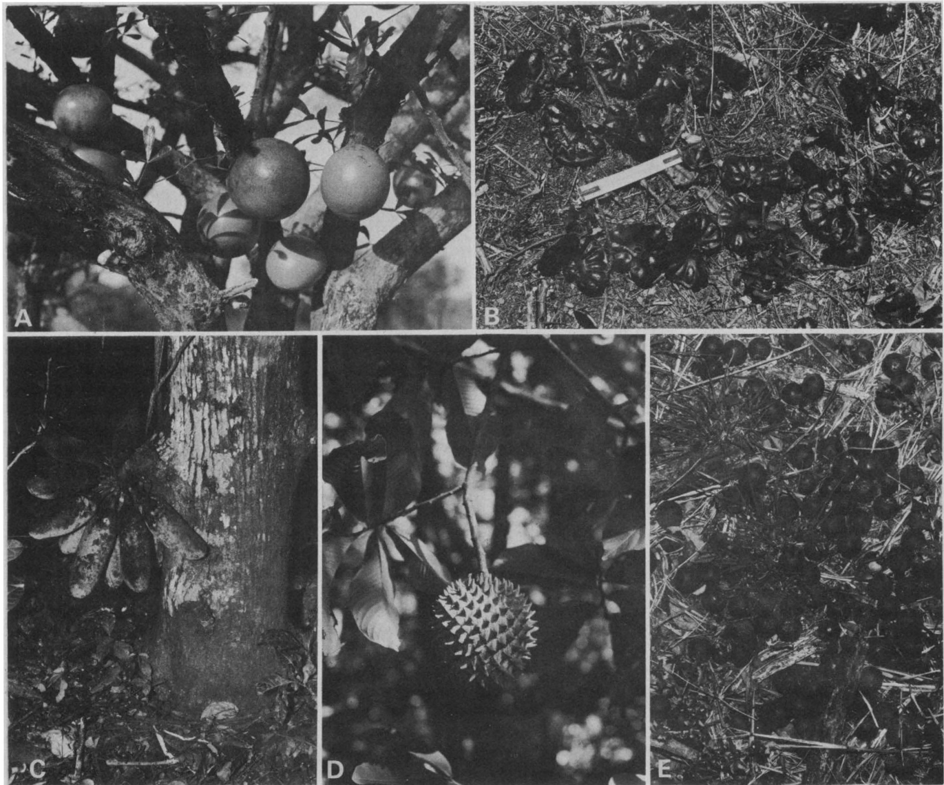
Fig. 1. Fruits (all to the same scale) in Santa Rosa National Park, Guanacaste Province, Costa Rica, that were probably eaten by Pleistocene megafauna: (A) Crescentia alata (Bignoniaceae), (B) Enterolobium cyclocarpum (Leguminosae), (C) Sapranthus palanga (Annonaceae), (D) Annona purpurea (Annonaceae), and (E) Acrocomia vinifera (Palmae) (19). The white portion of the ruler in (B) is 15 centimeters long.

The palm population occurs in riparian vegetation, dry hillsides, and wooded patches in grassland and is largely main-