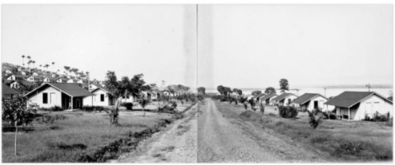
Photograph from "Fordlandia