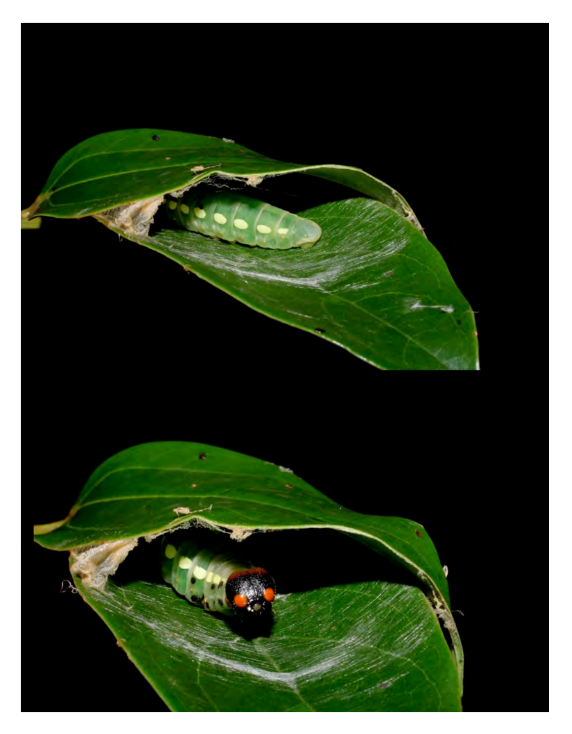
Fig. 2. The 50 mm last instar caterpillar of Costa Rican Ridens panche (Hesperiidae) when its leaf shelter is forced open (above) and a few seconds later (below) to present glowing red false eyespots directed at the invader and glowing lemon yellow eye spots in the dark of the cavern behind.