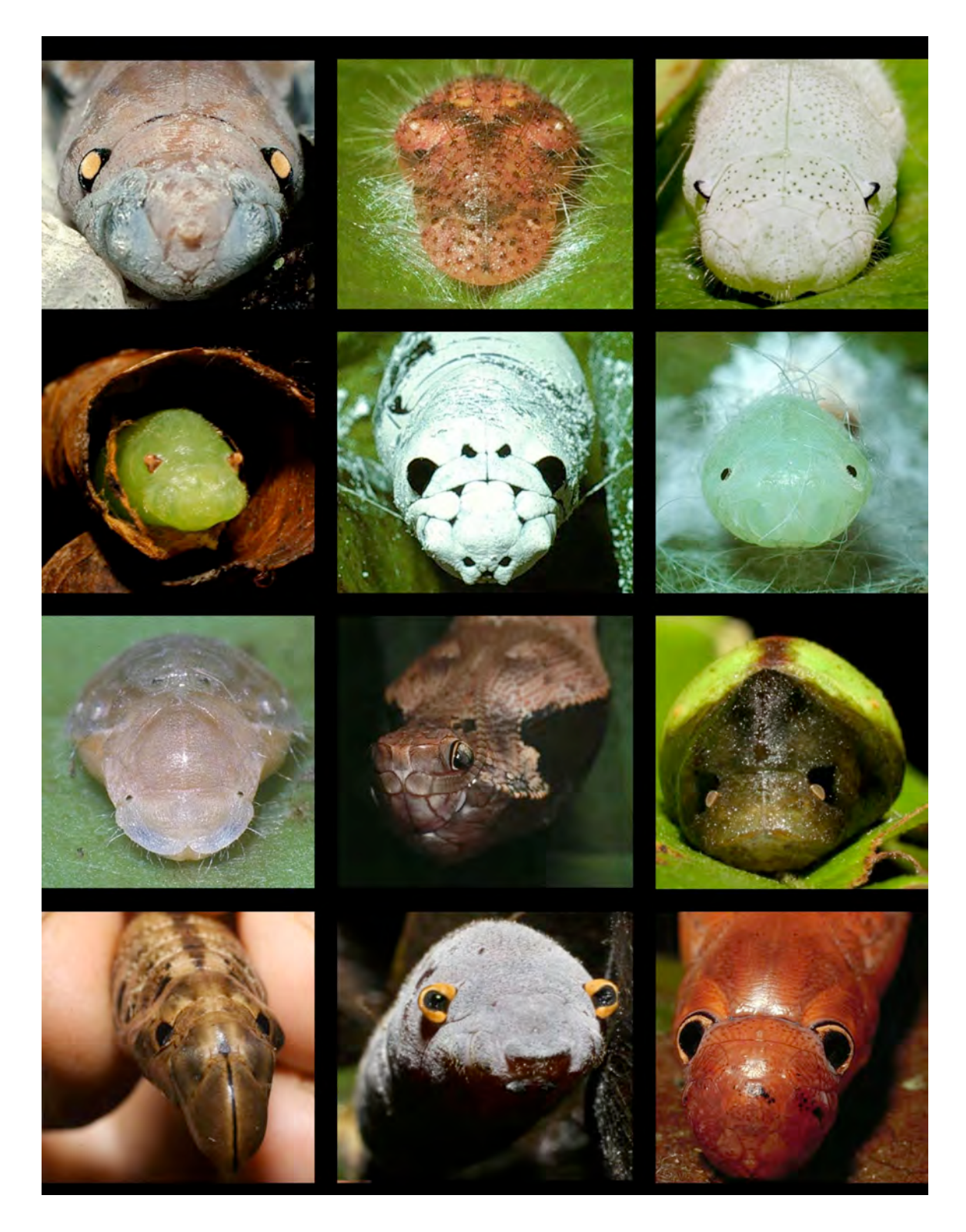
Figure. 6 ACG pupa false eyes and faces (see SI Appendix 1 for names, voucher codes and lateral/dorsal views).