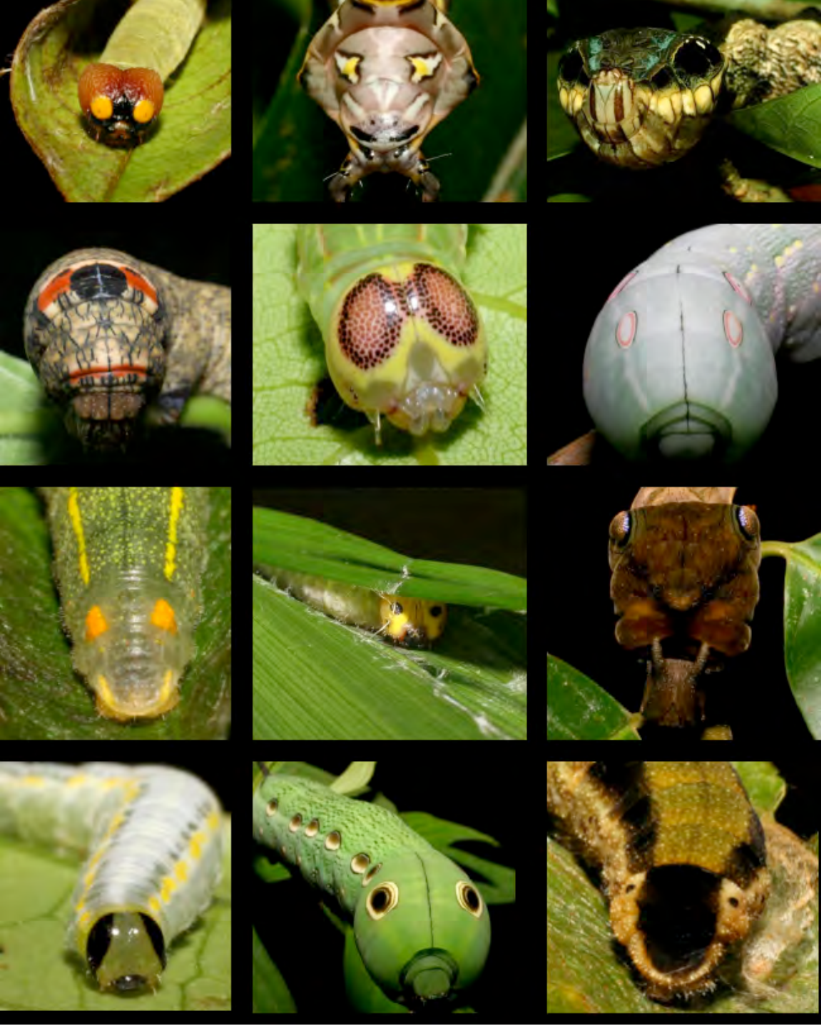
Figure. 4. ACG caterpillar false eyes and faces (see SI Appendix 1 for names, voucher codes and lateral/dorsal views).