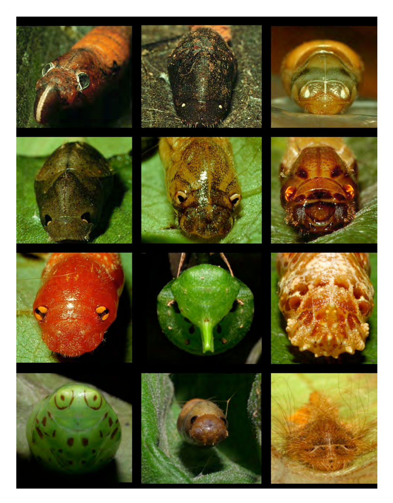
Figure. 5. ACG pupa false eyes and faces (see SI Appendix 1 for names, voucher codes and lateral/dorsal views).