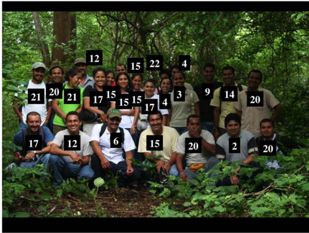
Figure 3. This is the majority of the members of the ACG Costa Rican resident parataxonomist team (a.k.a. “gusaneros”) in 2008 (Estación Biológica Santa Rosa). Each is labeled with the number of years he or she has worked conducting the ACG caterpillar inventory, and adult moth and butterfly inventory (BioLep).